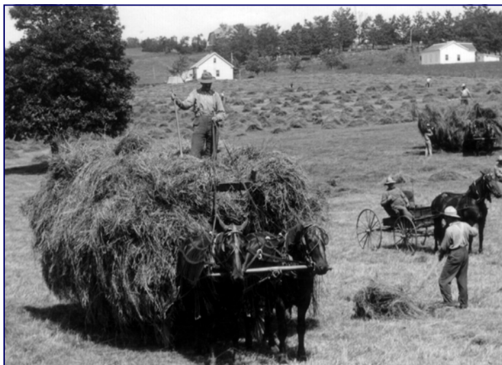
Haying on the flat below Meredith Square during the Meridale Farms era.